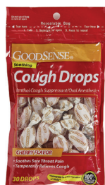
Cough Drops, Cherry Count: 30