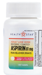
Aspirin, Enteric Coated Tablets, Low Dose, 81 mg. Count: 120