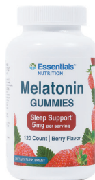
Melatonin Gummy, 5 mg.† Count: 120