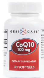
Coenzyme Q-10, 100 mg.† Count: 30