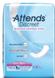
Attends® Discreet Women's Maximum Bladder Control Pad* Count: 20