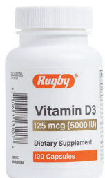
Vitamin D3, 125 mcg.‡ Count: 100