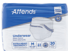
Disposable Underwear Pull-Up, Medium, 34" to 44"* Count: 20