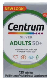
Centrum® Silver Vitamins† Count: 125