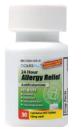
Cetirizine Allergy Tablets, 10 mg. Count: 30