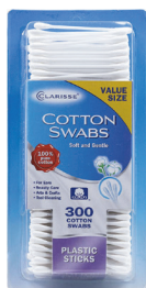
Cotton Swabs Count: 300