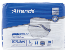
Disposable Underwear Pull-Up, Large, 44" to 58"* Count: 18