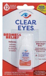
Clear Eyes® Eye Drops, 0.2 oz. Count: 1