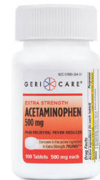
Acetaminophen Extra Strength Tablets, 500 mg. Count: 100