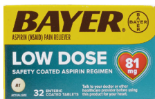
Bayer® Enteric Coated Aspirin, Low Dose, 81 mg. Count: 32