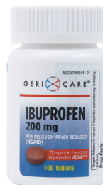
Ibuprofen Tablets, 200 mg. Count: 100