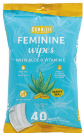
Feminine Hygiene Wipes Count: 40